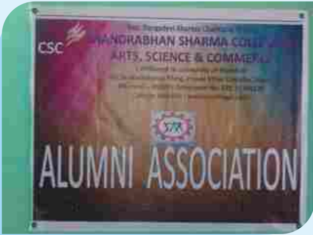
“Alumini Association Meet 2014 - 15”