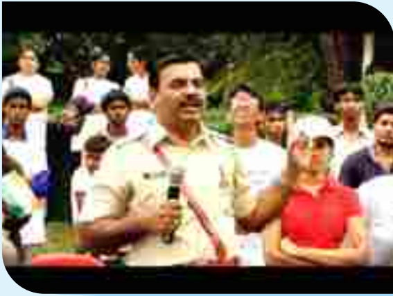
"Drug Awareness at Powai Garden"