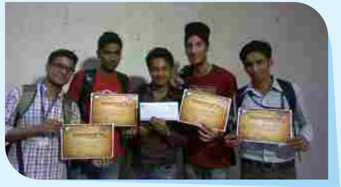
“Treasure Hunt” – Winners