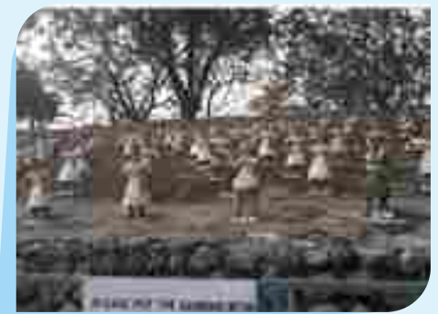
“Industry Visit to Micro Turners I I”