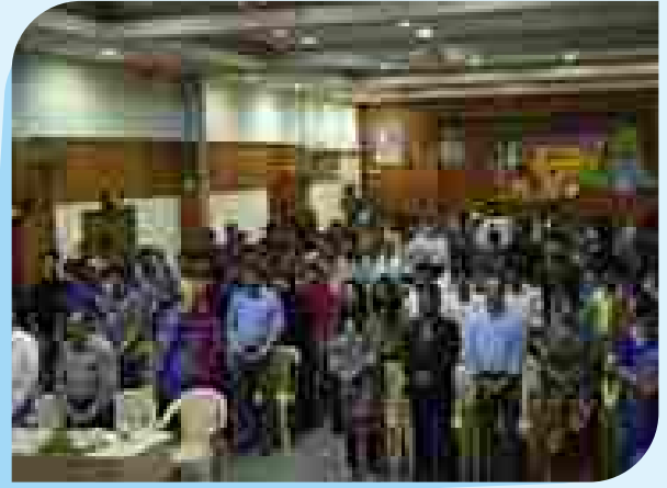
DLE Students from 10 colleges participated in seminar on "Maxplora, Exploring Entrepreneurship"