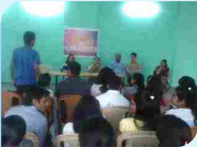
“Meeting chaired by the Principal”