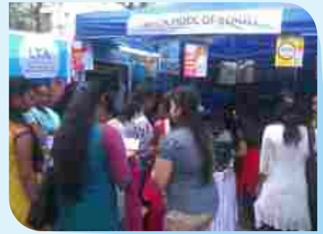
“Career Fair in College”