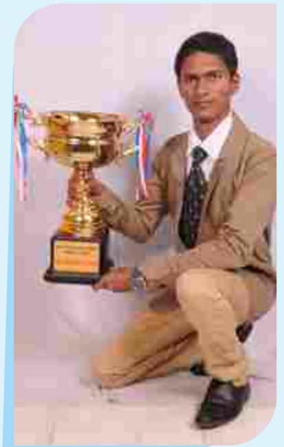
Sujal Pose National Cyber Olympiad