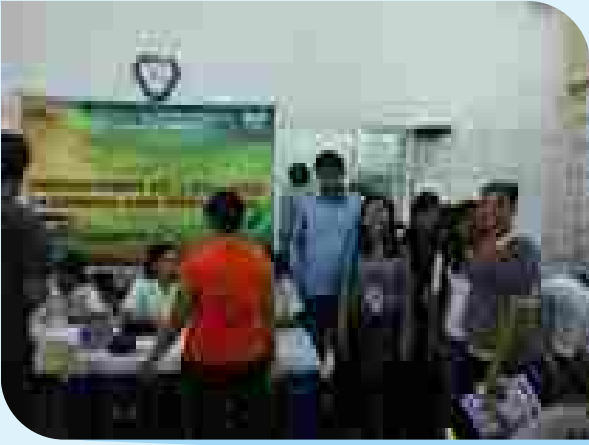
DLE students volunteered at blood donation camp at Hiranandani Hospital