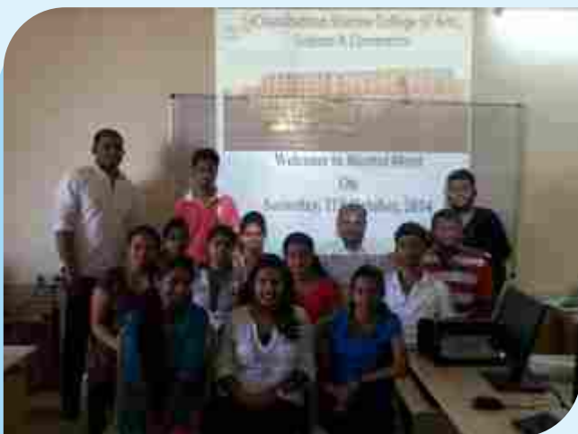
“Second gathering in October”