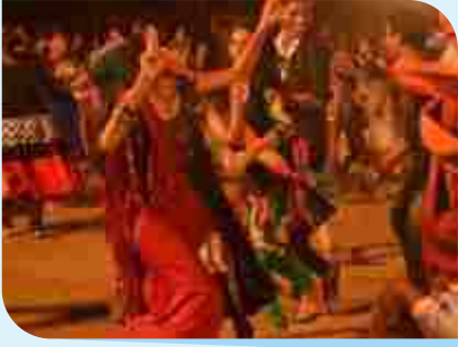
“Dandiya Night at CSC ground”