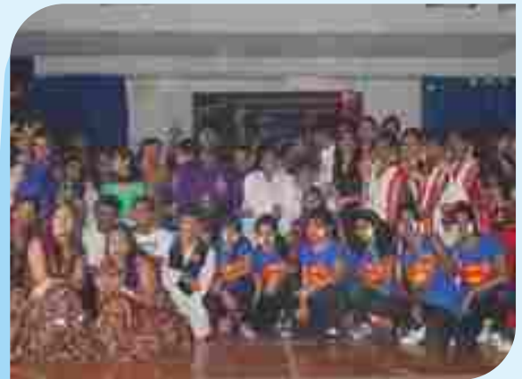
Events Held at Khwaish 2014 - 15