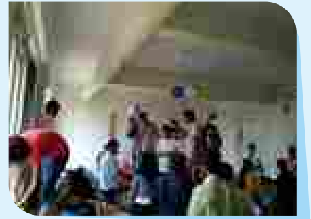
“Teachers Day and Friendship Day Celebrations” “Class Room Decoration for Friendship Day”