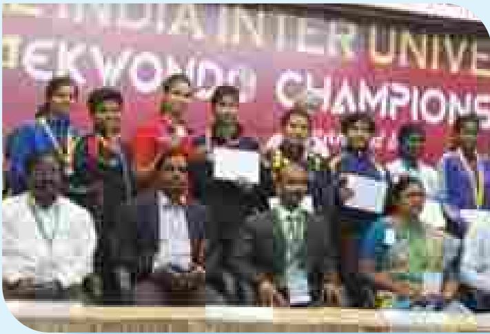
University Taekwondo Championship