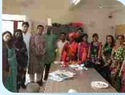
“Traditional Day Celebrations”