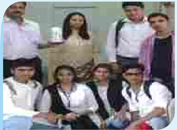
DLE students won consolation prize for skit performance