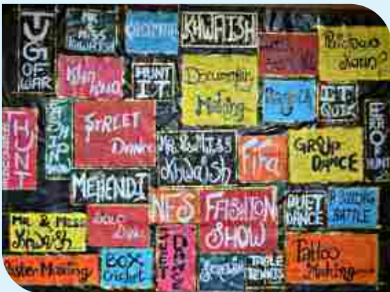
“List of Events in Khwaish”