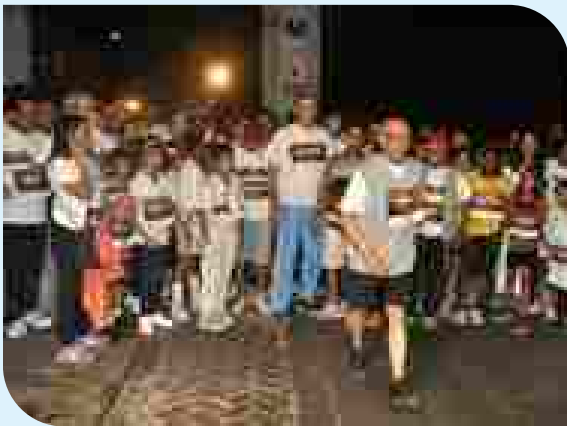
"Run Powai Run"