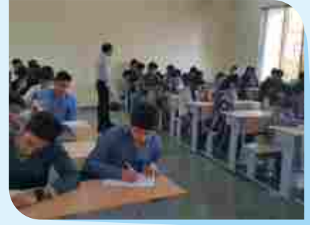
“Acquist Solutions” – Interviews On-Campus “AIMSR Seminar & Quiz”