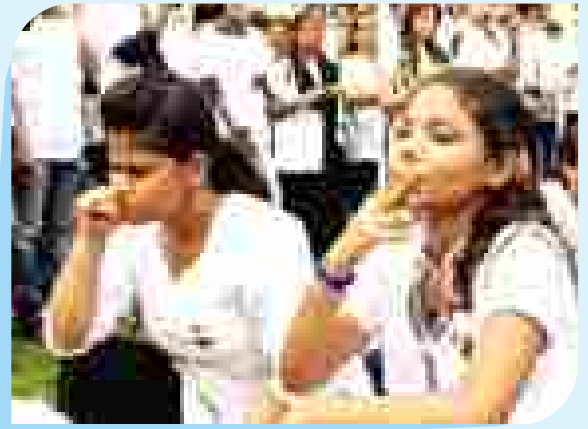
"Drug Awareness Play at Powai Gardens"