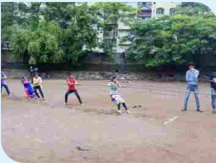
“Tug of War Competition”